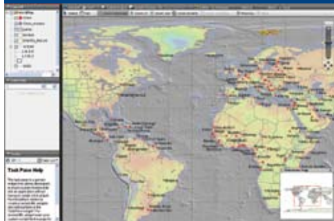
Flexible Layout Template design showing a map with capital cities, created using raster digital elevation map and vector data from SDF and Oracle.

New Flexible Web Layout Templates and application widgets accelerate the development of web mapping applications created with Autodesk MapGuide Enterprise. Since design and development tasks are separated, both nonspatial web designers and application developers can quickly build rich web mapping sites. With access to a growing number of widgets and web templates, designers can focus on site aesthetics without writing much code. And developers can freely focus on building powerful interactive AJAX (asynchronous JavaScript® and XML) applications.